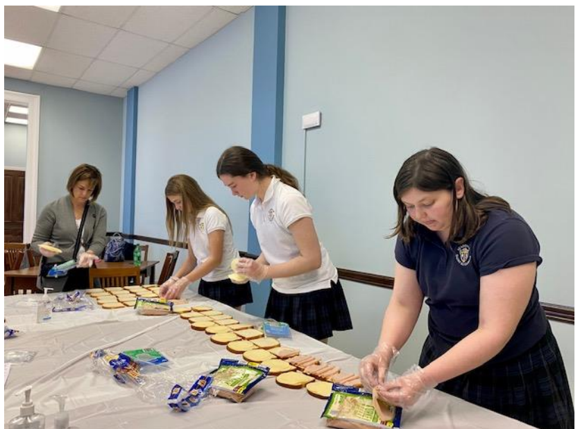
Students from the Academy donated their time and talent to make sandwiches for those facing food insecurity.