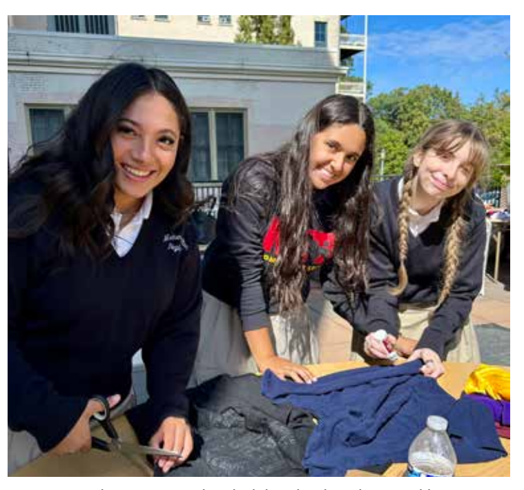
Mother Seton Regional High School students making tote bags out of T-shirts.