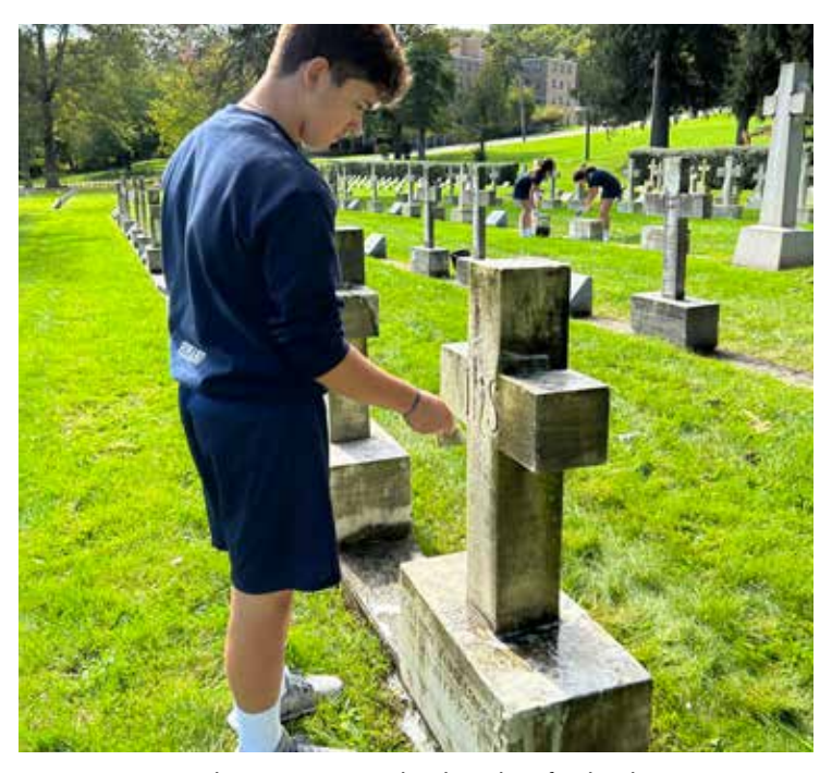
St. Vincent Martyr School student freshening up the Sisters' headstones.