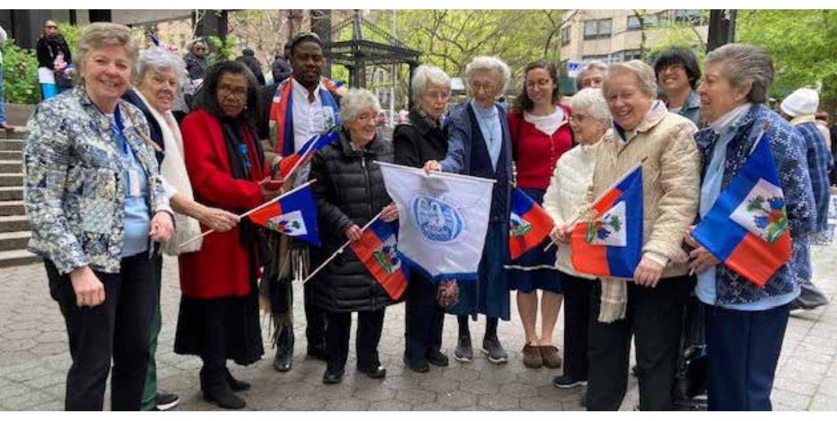
Sisters and Seton Associate gather for the walk.