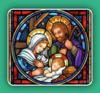
Christmas Concert December 21, 2024 Holy Family Chapel, Convent Station NJ